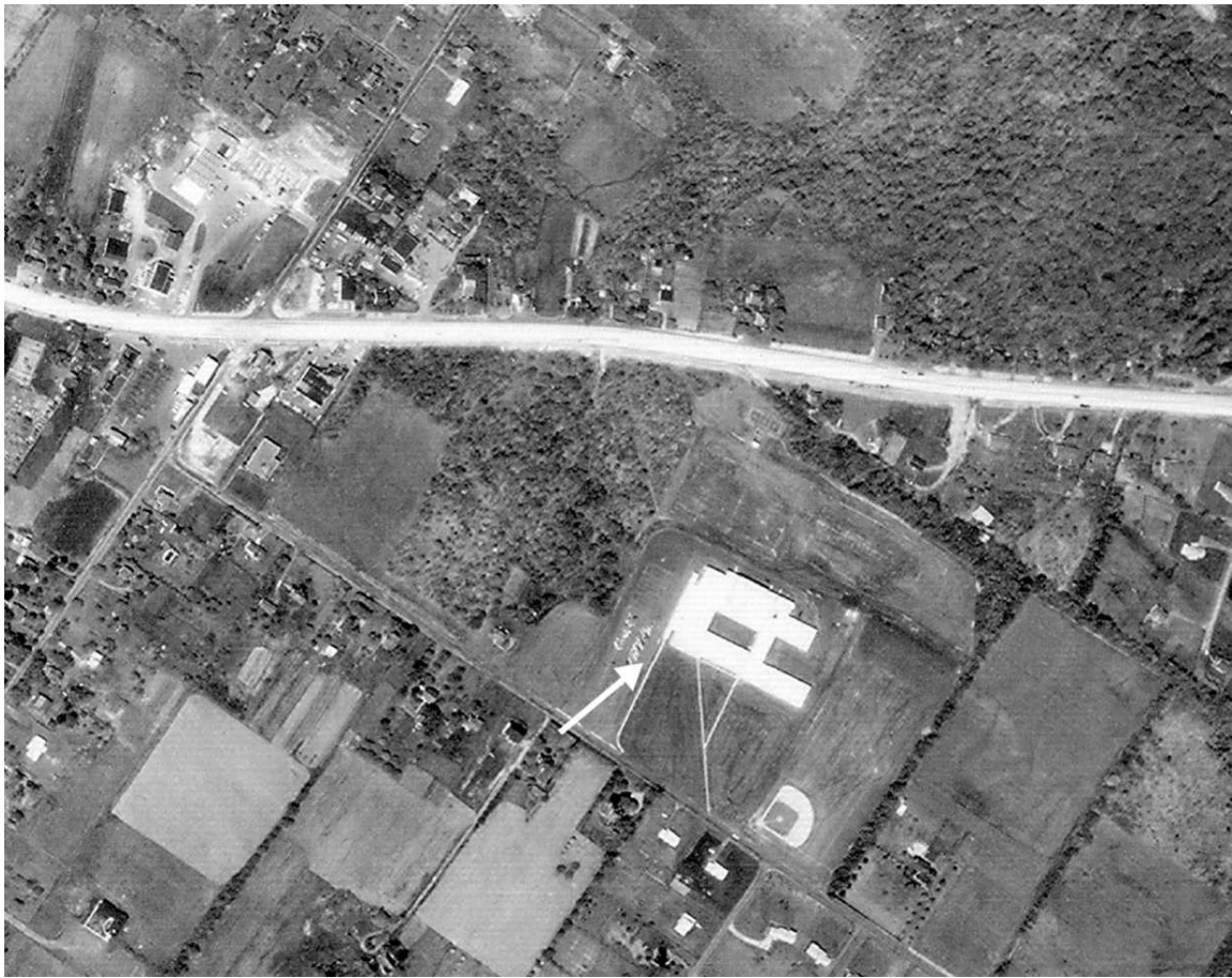
Aerial Photographs of Tamanend Middle School